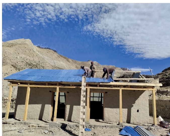
SOLAR PASSIVE BUILDING IN NAMDO SCHOOL

«Currently we have only a day boarding system but I'm planning to build hostel for school. I'm also thinking of adding more blocks as hostel kitchen, dormitory rooms and study room for children. Along with it I want to make badminton and table tennis area in newly bought land of school.» (Pemma Wangchen Gurung)