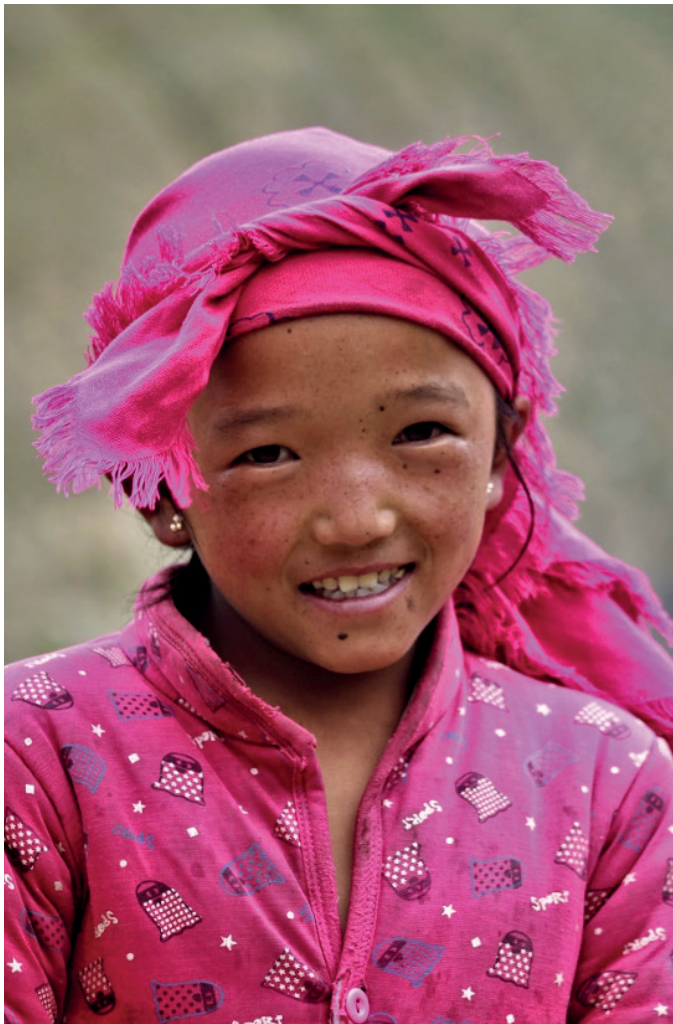
GIRL FROM NAMDO SCHOOL