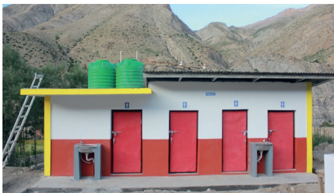
NEWLY BUILD TOILET WITH HAND WASHING BASIN.