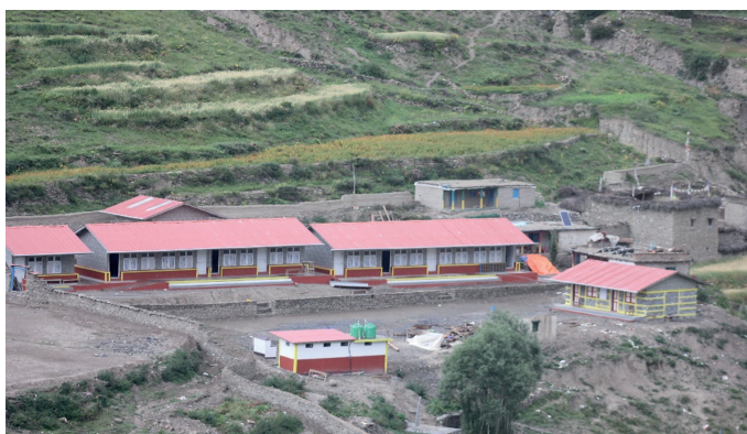
VIEW OF THE RENOVATED NAMDO SCHOOL

Comparing to previous year this year it wasn't that much challenging for student and teacher to take class. Somehow classroom for class 6 was managed by giving classes in staffs room Varanda. Rotary provided books for our library. Our children are enjoying the new books.