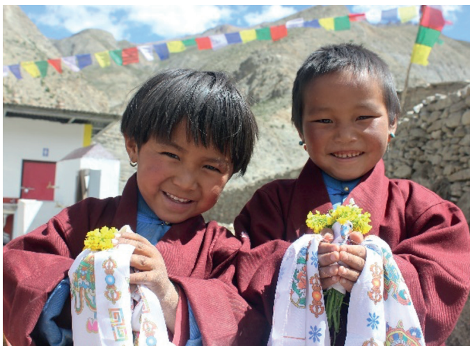
TWO CHILDREN IN NAMDO SCHOOL

The students need to attend 2 exams (1st and Final Examination) in between the class tests are taken by the teachers. With full marks of 40, the 1st term exam is taken and with 60 the final exam is taken. Finally both exam are tally and the result for the session is prepared. To pass out the exam each student needs to get above 40 marks on each subject.