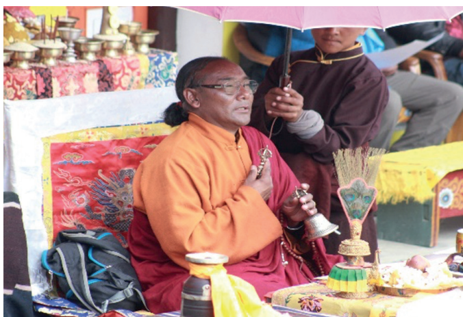
RESPECTABLE KOMANG TULKU RINPOCHE BLESSING THE NEW SCHOOL BUILDING

From the very past year Schulverein Lo-Manthang come up with distributing food supports to needy and poor family of Namdo. As China border had been closed for last 2 year, the people of upper Dolpo aren't able to get food supply from China. For needy and poor ones they depend on Yarstagumba hunting as a financial income. As border and hunting Yarstagumba were closed by Nepal Government for precaution by which the needy and old people aren't able to have food support.