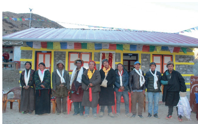
NEWLY ELECTED SMC MEMBER FOR NAMDO SCHOOL

Our thanks to each ones who involved in this Pandemic Relief Food Support to Needy ones of Namdo.