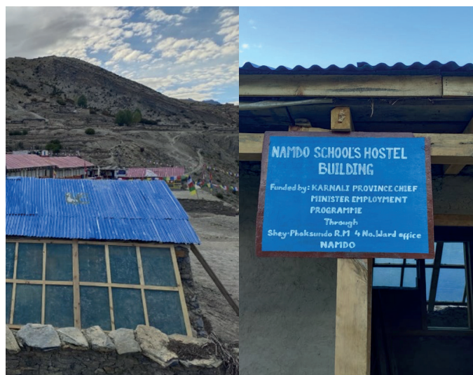
SOLAR PASSIVE BUILDING IN NAMDO SCHOOL

As sunlight passes through transparent fiber glass. The room will be warmer and because of sunlight the room will be bright too.