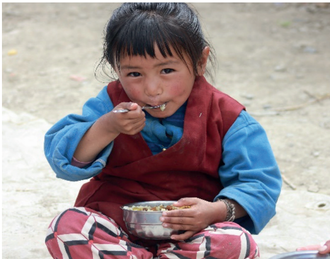
GIRL EATS RICE MEAL

Last year due to Covid19, lunch meal program wasn't implemented. As on year 2020, Flu and Cough can be seen among a children. It seems very risk to made food sharing among a student. As a prevention lunch Meal wasn't done. But with the same budget on year 2021, the lunch meal program was implemented as Covid wasn't hitting that hard at Namdo.