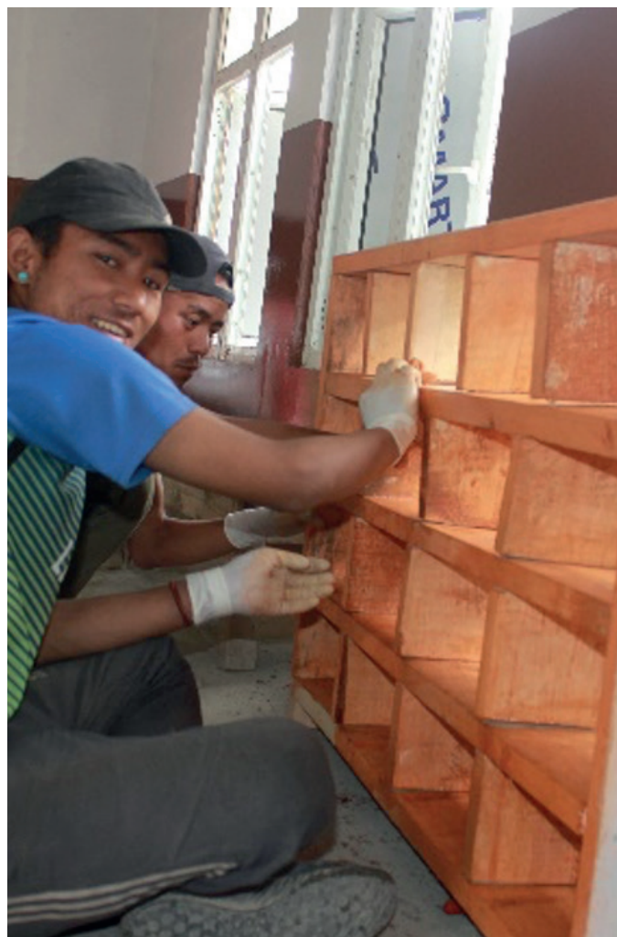
CARPENTERS AT WORK

«We are very much thankful for the furniture proposal. As furniture were basic need for the complete classroom setup.»