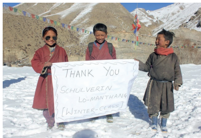
THREE CHILDREN FROM NAMDO SCHOOL

Winter class plays important role in keeping backup knowledge for new session. As winter class facilitate hostel system, the children can easily interact with teacher time and again by which children knowledge can be broaden. This year we have around 60 student who attended winter class. Four teacher and two cook looked after the student.