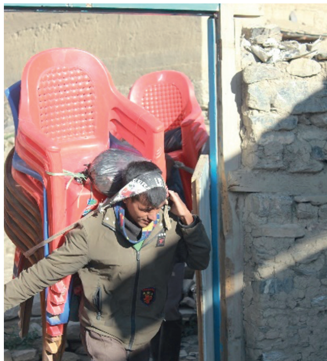
PLASTIC CHAIRS FOR THE TEACHERS

As 80% of most of the furniture works were already done on 2020. On 2021 rest 20% were also done and the completion on Furniture proposal was closed this year. This year plastic chair and table for teacher were bought and made by carpenter. Along with it additional rack, shoe rack, doors and shelves were made. After the completion of furniture work, the teacher involved in volunteering work on coloring the furniture on Saturday. The colored furniture looks attractive and it long last for further more year.