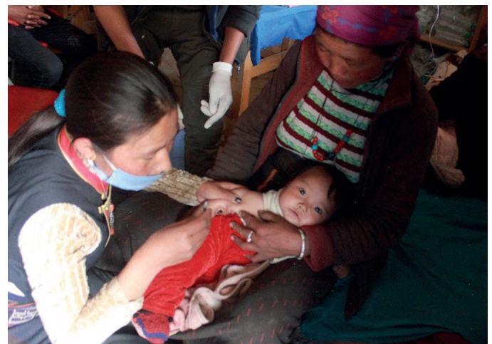
INFANT IMMUNIZATION GIVEN TO BABY

Every year the government in Nepal provides infant immunization to avoid diseases. Like previous year this year too the infant vaccine were given to newly born baby and toddler. Rural Municipality health staffs provided the infant vaccine and the immunization were given by nurse here at Namdo.