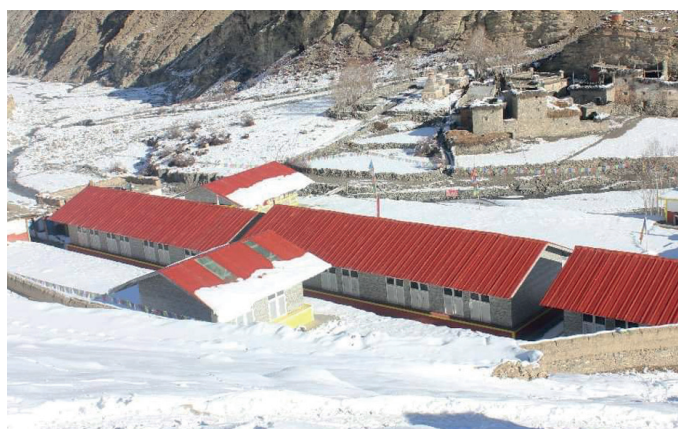
NAMDO SCHOOL IN WINTER

We are very much thankful to Schulverein Lo-Mant-hang for winter class program.