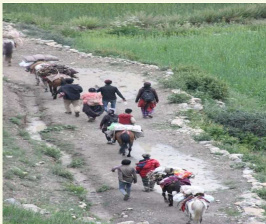
Villagers transporting food supply from Dunai.

After the COVID the border with China was closed and it's been 4 years that people of Dolpo had been buying all the food and supplies from Dunai (headquarter of Dolpa). The requirements suppliers get more expensive at Dunai rather than in China. To transport the materials from China it takes 2 days but from Dunai it takes 4 days. Hence, the transportation cost need to be paid double.