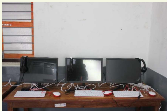
OLE Nepal programmed desktop.

On our class routine we separated a Computer Lab period for senior students. Classes from 3 to 6 can get chances to use and gain knowledge. Children are now able to get knowledge through virtually and can access to get knowledge easily. As these things are new to our students they get much more excited and happy to use the desktop. Our teacher are able to take text book related knowledge through computer as a reference for teaching the students.