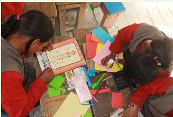
Students preparing Christmas card to sponsors.