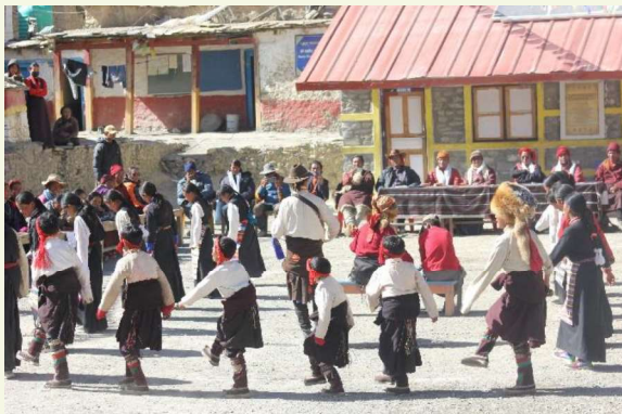
Students doing traditional dance at result announcement day.