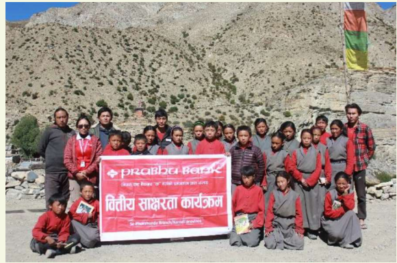
Senior students given banking knowledge by Prabhu Bank staffs at school.