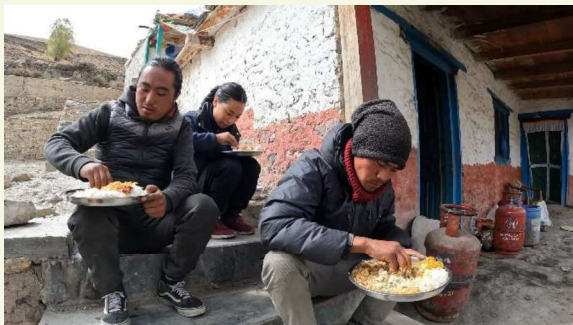
Teacher taking their lunch on kitchen veranda.

The association is very much happy for accepting the proposal and working on raising the fund for upcoming construction.