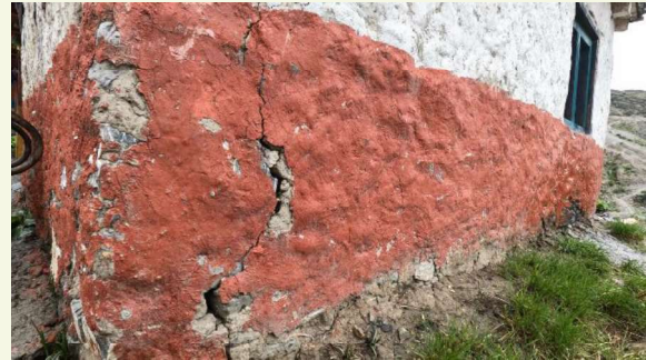
Cracks wall of staff's room.

The association is very much happy for accepting the proposal and working on raising the fund for upcoming construction.