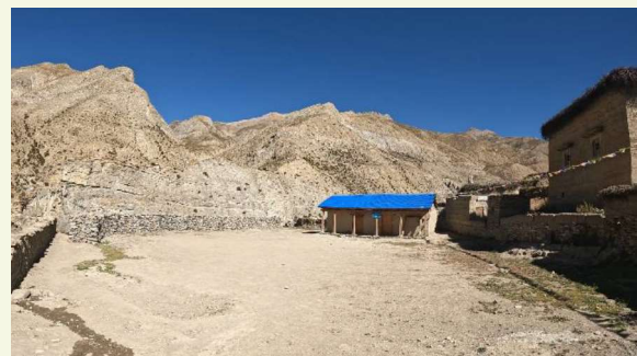
Around 360 sqm area for upcoming construction.

On the academic result announcement day, I made announcement about the upcoming construction program and villagers are happy to be part and wanted to contribute on construction.