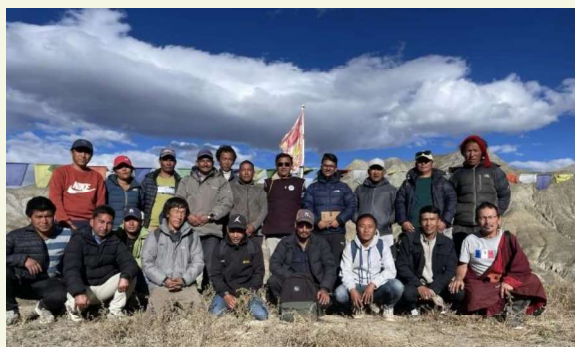
Schools coordinators and headmaster with Rural Municipality team.

For upcoming year Rural Municipality wants to resume the program and wants to make impact on development of schools.