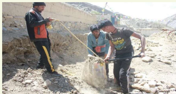
Labor worker of Jajarkot working in a site.

Veranda work: As the crack of concrete cement was seen on front of veranda and staircase. The veranda and staircase were dismantle. The stone soiling and beam reinforcements work was done later veranda slab and staircase concrete was done.