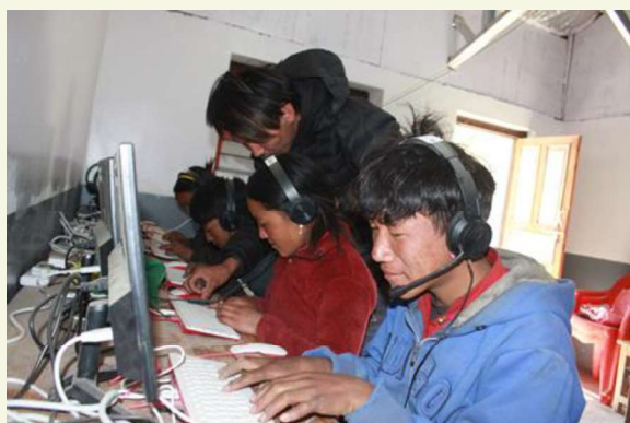
Students enjoying their OLE programmed desktop.

Current world news are being easily gain by teacher through internet. As information updated teacher can help and work on building students’ knowledge. The local residents of Namdo are also able to connect with their relatives at Kathmandu and foreign through internet too. As we realized that the Internet may distract and creates disturbance to classes we come up with idea of using Internet after 4:00 P.M at evening.