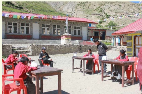
Inter house handwriting competition.

It's been a year that we scheduled Friday as an ECA day, we don't allow students to bring bags and books during almost every Friday. We let our children involved on different outdoor activities.