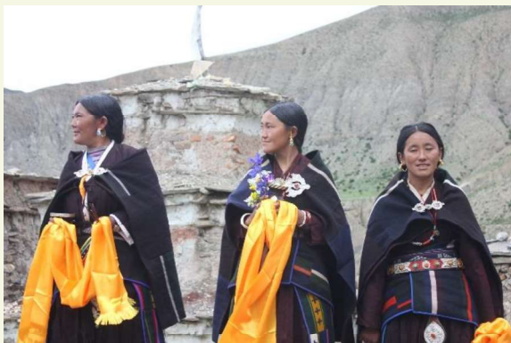
Namdo women on their traditional attire.