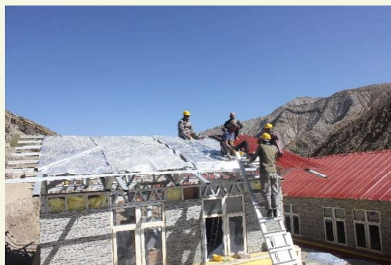
CGI roof being install by experts.

Additional strut were connected to principal rafter for better support.