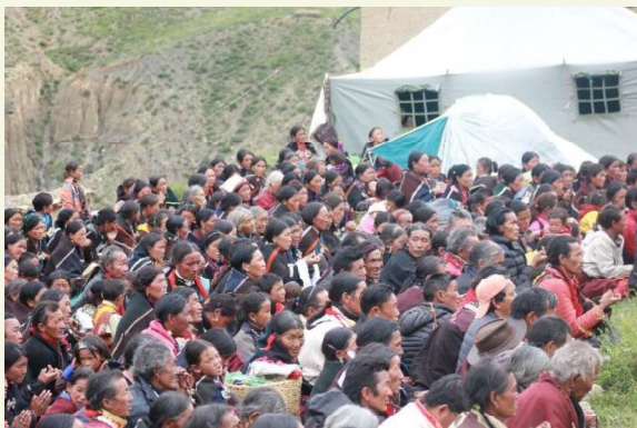
Namdo villagers getting blessing from Rinpoche.