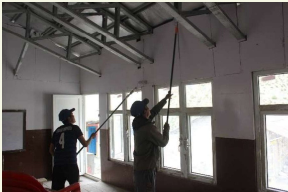
Helping hands of teachers painting the wall.

Toilet renovation: On toilet slab the bitumen cover sheet was covered. Along with it concrete repair was done on sink hold. The water tank was given support and the pipe maintenance was also done.