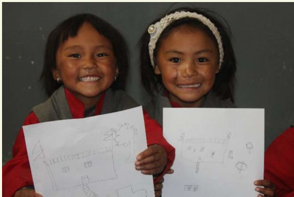
Kindergarten students showing their arts.

The school opened on 1 st may with total of 90 students, where 60 of them were girls and rest 30 were boys. Compare to previous year the number of student deducted drastically. On previous year the school run with up to 100 and more student. The main reason for less number of male student is, as region itself is highly influenced by Buddhism and Buddhist teaching. The male student leave school and were sent to Monastery for Buddhist teaching as a monk.