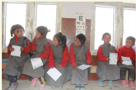
Kindergarten students waiting for the free eye checkup given by Vision Together team.