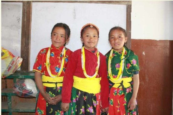
Girls on typical Nepali dress.