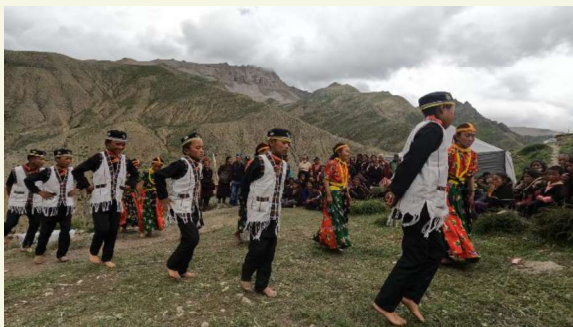
Students dancing in Nepali song.

As these things were new to our children and their parents. During startup of this program parents aren't that much agreed on letting their children involved on outdoor activities rather than letting them do their academic studies. Now we are able to change the perspectives of the parents and are agreed on letting their children involved in ECA activities.