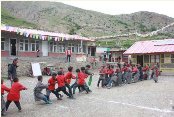
Inter house tug of war competition.