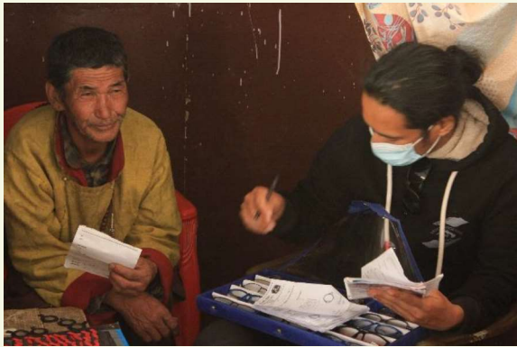
Mr. Gyurmey (parents) being checked up by experts.