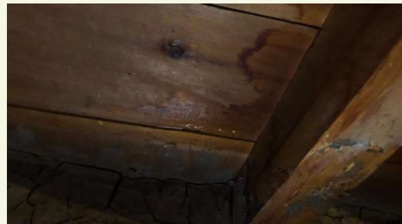
Leakage of rain water from ceiling.

As number of students are gradually increasing, on year 2021, the school association bought around 360 square meter area nearby school area, for futuristic plan on infrastructure development. Like we predicted the open ground area can be in use in upcoming construction. Currently we have around 1020 square meter area on school association name on governmental record.