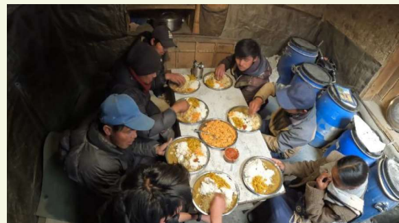
Staffs having lunch on current kitchen.

On year 2022, I verbally proposed new kitchen and staffs room. As current kitchen area is very much congested and staffs doesn't have enough room to stay. The current kitchen was built in year 2011 through governmental support and staff room in year 2013 through project fund support. The building walls are cracked and the room doesn't seems long lasting at all. During monsoon through the ceiling the leakage of water can be seen in every single room.